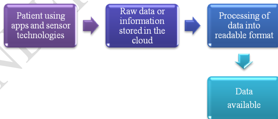
Figure 1: showing interconnection between data collection through devices and software and its appropriate use in teledentistry.