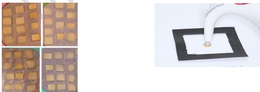
Figure 1. Samples in a mold with an exposed outer surface (staining surfaces)

A total of 48 specimens were fabricated from feldspathic (Vitablocs Mark II) and multilayered zirconia (Ceramill Zolid PS) CAD/CAM ceramic materials (Vita Zahnfabrik) by using the CAD/CAM system. The dimensions of the disc-shaped specimens were 16 \text{ mm} \times 12 \text{ mm} \times 1.2 \pm 0.2 \text{ mm} . The thicknesses of the specimens were measured by using a digital caliper (Absolute Digimatic Caliper, Mitutoyo Corporation, Aurora, IL, USA). Each group comprised 24 specimens. The specimens were sintered and glazed in a furnace for 2 h at 1550^\circ\text{C} .