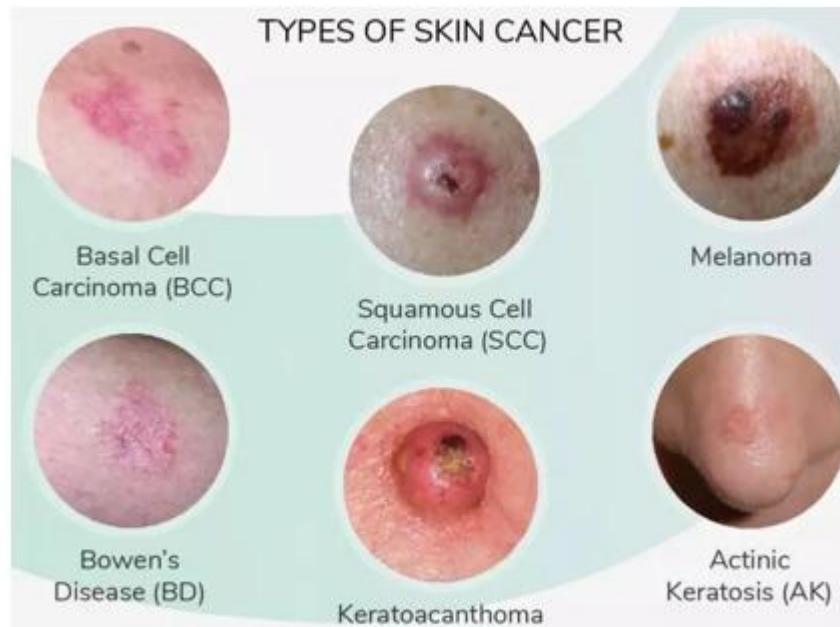
Figure 1: Different Types of Skin Cancer

Non-Melanoma Skin Cancer NMSC incorporates, among others, Bowen's malady, basal cell carcinoma (BCC), and squamous cell carcinoma (SCC). In Caucasians, the rate of NMSC is higher (by as much as 18–20 times) than that of MM. Different types of Skin cancer has been depicted in Figure 1. As, there are huge impediments to NMSC the study of disease transmission, for the most part credited to checked geographic varieties in rate rates, just as to rejection of NMSC by huge cancer growth vaults because of low death rates. Indeed, even optional investigations, whereby frequency information are separated from authoritative human services databases, are nearly restricted[2].