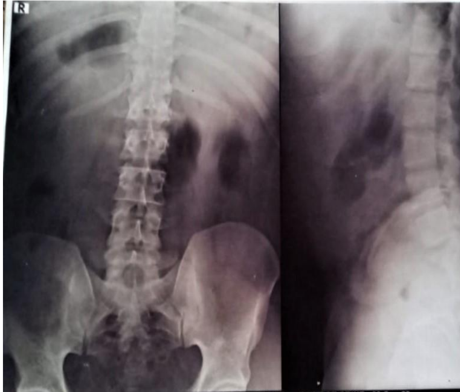
Figure 3 x-ray LS

followed up the patient for further 6 months. But there was no recurrence in the symptoms. However, it should be noted that, the patient feels the low back pain occasionally, but it is very mild, and it often gets relieved by local massage with sesame oil/Nirgudi oil and sudation with sand at home. The patient also consumes cod liver oil capsules as soon as the episode of low back pain appears. He mentioned 2 -3 times the episodes of low back pain in these 6 months.