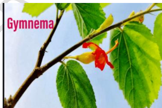
Figure 1: G. sylvestre parent plant

wood, growing plant which is indigenous to India and relates to Chyoanpyase group. Madhumeha (glycosuria) and other urinary diseases are destroyed by G. sylvestre , according to Sushruta. It was given the name gur-mar, which means sugar killer, because of its ability to eliminate the taste of sugar, and it is thought to be able to counteract excess sugar in diabetics. A vulnerable species, G. sylvestre (Asclepiadaceae), is indeed a slow-growing perennial medicinal wood climber endemic to central and peninsular India. A 5-year-old parental plant is shown in Figure 1. It's a powerful anti-diabetic plant that's been used in ancient, ayurveda, as well as homoeopathic medicine for millennia. Asthma, eye problems, inflammations, family planning, and snakebite are all treated with it. Hepatoprotective, antihypercholesterolemic, antibacterial, as well as sweet-suppressing activities too are present. It's also been used in skin treatments, as just a feed intake inhibitor for caterpillar Prodenia eridania , and also to minimize Streptococcus mutans -caused dental caries.