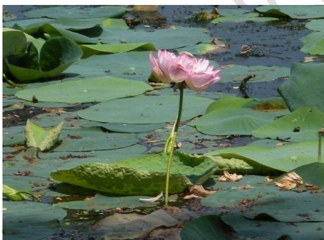
Fig 2: Kamal