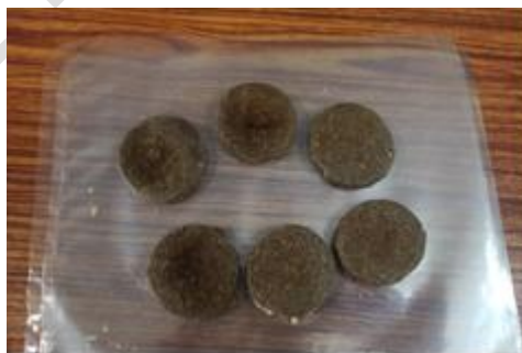
Fig.3 F2 Cookies