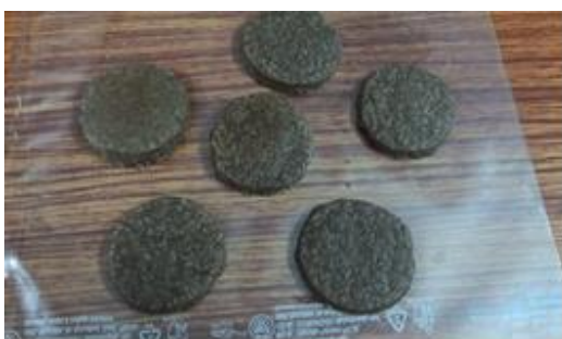
Fig.4 F3 Cookies