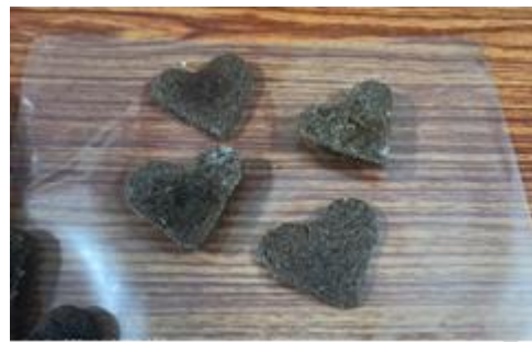
Fig.5 F4 Cookies