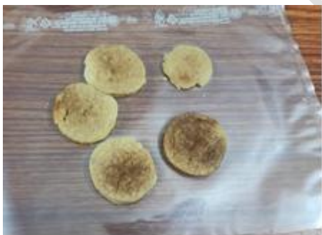
Fig.2 F1 Cookies

The procedure for preparation of cookies is followed as shown in flow sheet. The resulted products from four formulations of one control sample and 3 formulations of date seed powder incorporated cookies varied in physical, chemical and organoleptic properties. The prepared cookies are shown in Fig- 2, 3, 4 & 5 .