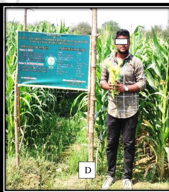
Fig 1. A and B at the time of sowing and readings at 15DAS C and D Spraying Feso 4 at 40DAS and harvest stage for during trail period