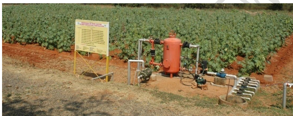
Plate 1 Imposition of drip fertigation ( I_1 - I_8 ) treatments

Customized drip system was installed in experimental field during 2013-14 Narkhoda farm and the experiment was continued in fixed plots till 2015-16 (Plate 1). Drip system was laid out in such a way that the main pipe was connected with head unit. The line was divided into sub main having separate controlling valves for each irrigation level ( I_1 - I_8 ) as per the treatment. Lateral lines connected with sub main were laid out at a distance of 120 cm. The in-line drippers were spaced on lateral lines at a distance of 60 cm.