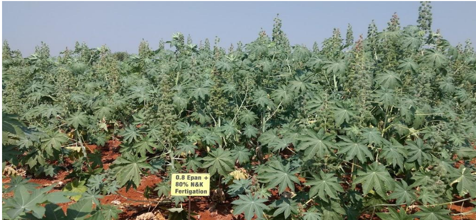
Plate 2 Performance of castor (DCH-519) through drip fertigation

Similar trend was noticed in stalk yield. Significantly highest stalk yield (5883 kg ha -1 ) was recorded with drip irrigation at 0.8 Epan +100% N&K through fertigation (I 6 ). The lowest stalk yield was recorded with surface method of irrigation (3921 kg ha -1 ). Studies conducted in Greece, the seed yield of 1080 kg ha -1 was observed on the hybrid Pronto with 147 mm of rain was increased to 4040 kg/ha due to the addition of 363 mm of water through irrigation (Koutroubas et al. , 1999). The higher yields in drip fertigation treatments could also be attributed to production of more female flowers. The proportion of male flowers in surface method of irrigation was higher (38%) compared to minimal male flower production in drip fertigation plots (Table 2). Thus, higher proportion of female flowers in relation to male flowers resulted in higher seed yield in drip irrigation/fertigation treatments.