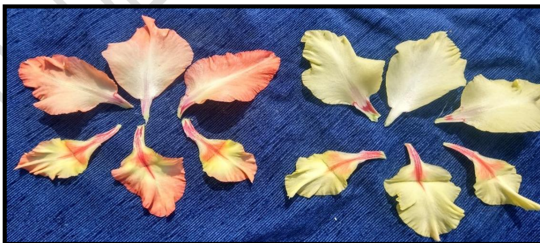
Plate-IV: Effect of gamma irradiation on gladiolus cv. Saffron