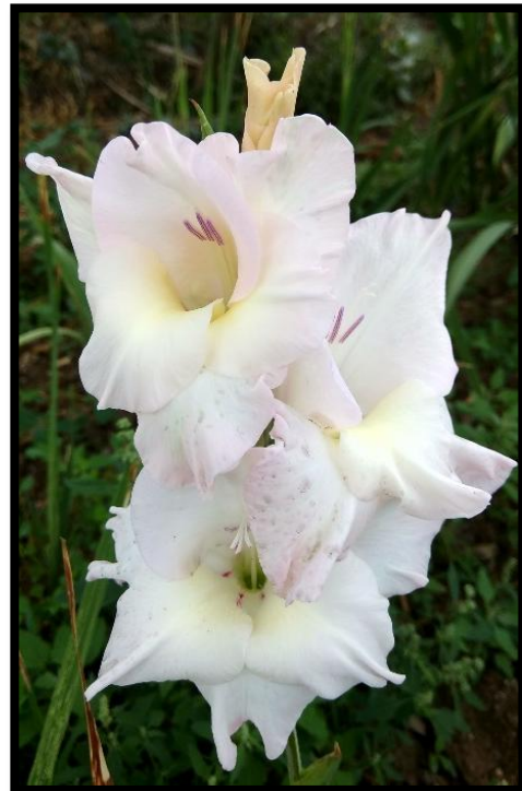
45 Gy, White colour mutant