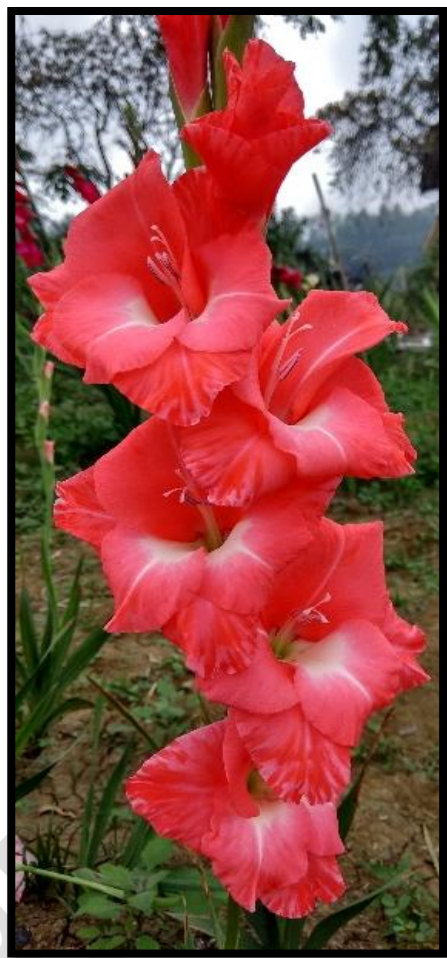
45 Gy, Orange Red