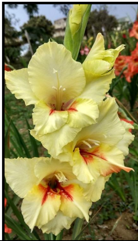
45 Gy, Greenish yellow with red strip on throat