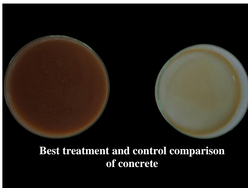
Fig. 3. Comparison of the concrete of the T1 and T6