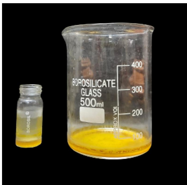
Fig 1. Concrete obtained through solvent extraction