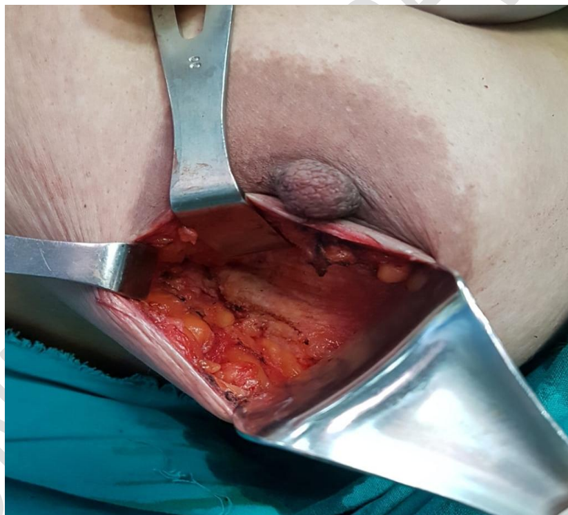
Figure (2): The resection defect after wide local excision of the tumor.

The resection defect created inside the breast after tumor resection was meticulously closed by Vicryl2/0. ( Figure 3 ).