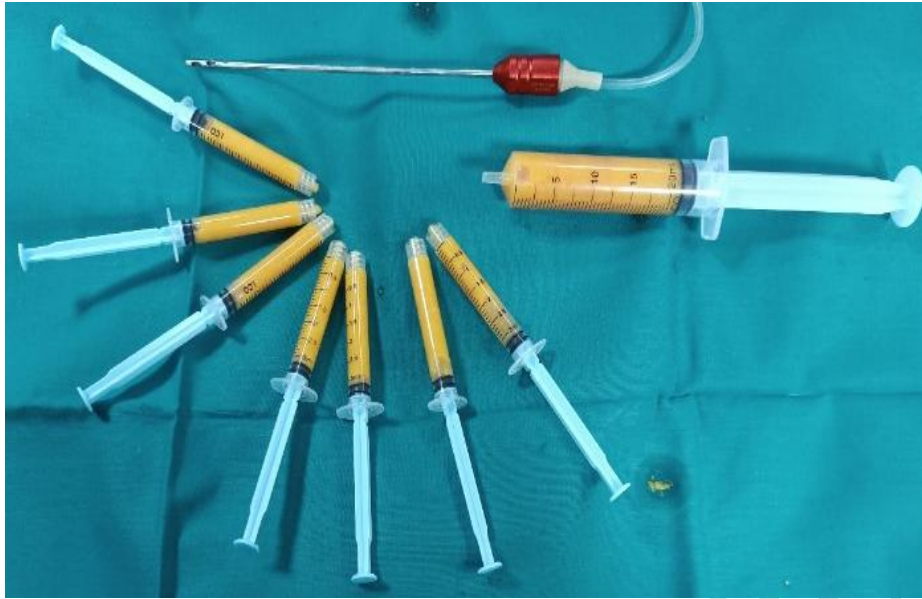
Figure (8):Centrifuged harvested fat ready for lipoinjection with lipofilling cannula .