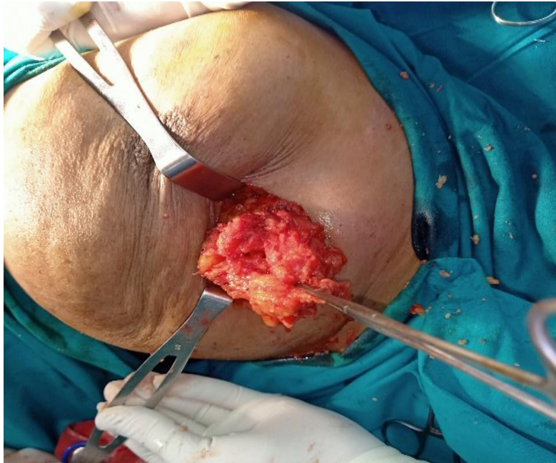
Figure (1): Wide local excision of the tumor with safety margin.