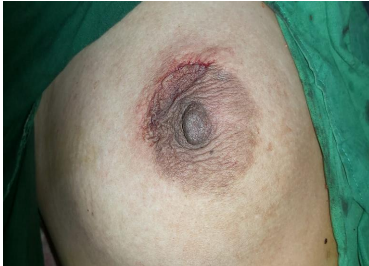
Figure (3): Closure of the incision after removal of the tumor.