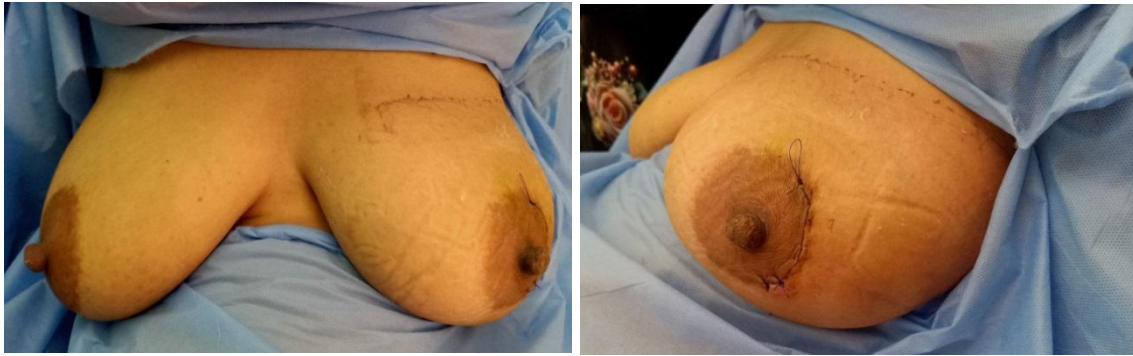
Figure 12: Early postoperative photo showing normal left breast shape, normal overlying skin, and clean wound with symmetry of both breasts.

After 6 months, mammography with complementary U/S showed 4 cases (10 %) have cystic lesion with clear content most likely oil cyst. Also, detected small cystic lesion with turbid content likely abscess (chronic) in 4 cases (10 %). Also, fourteen case (35 %) showed well defined area with some calcification most likely calcified hematoma. In addition, eighteen cases (45%) showed ill-defined area of architectural distortion due to post-operative sequelae. (Figure 13,14)(Table 2)