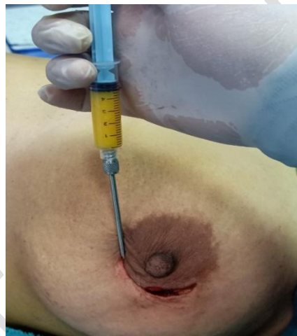
Figure (10): Injection of the fat (Lipofilling) using 2ml cannula through the wound .