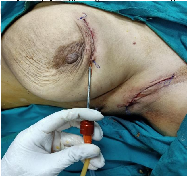
Figure (11): Injection of the fat (Lipofilling)

The incisions used for infiltration as well as those used for harvesting were closed with 6/0