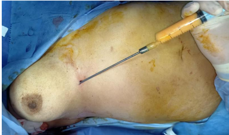
Figure (9): Injection of the fat (Lipofilling) using 2ml cannula from inframammary fold.