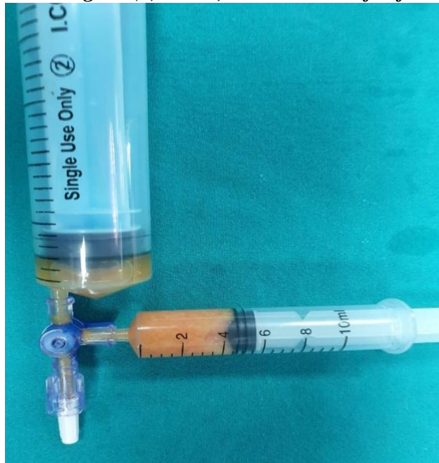
Figure (5):Fat evacuation in 10 ml syringe by connector (stop cock)