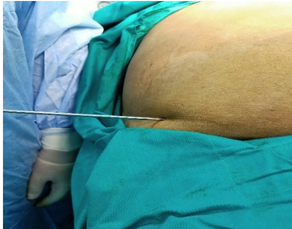
Figure (4):3 mm, blunt cannula for fat harvesting