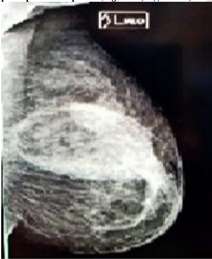
Figure( 13): Mammographic appearance after 6 months showing postoperative sequelae in the form of fairly defined area of architectural distortion.

After 6 months, mammography with complementary U/S showed 4 cases (10 %) have cystic lesion with clear content most likely oil cyst. Also, detected small cystic lesion with turbid content likely abscess (chronic) in 4 cases (10 %). Also, fourteen case (35 %) showed well defined area with some calcification most likely calcified hematoma. In addition, eighteen cases (45%) showed ill-defined area of architectural distortion due to post-operative sequelae. (Figure 13,14)(Table 2)