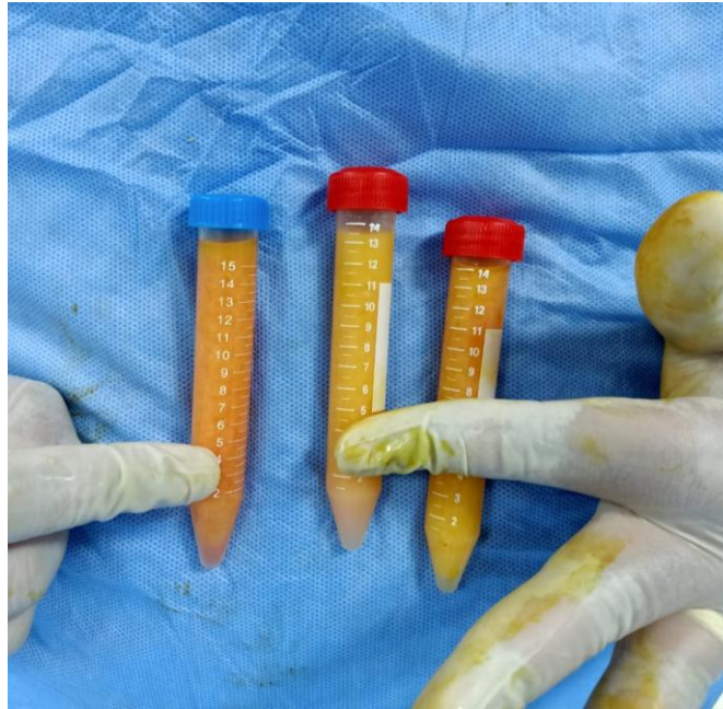
Figure (6):The harvested fat.