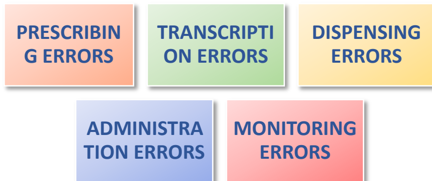
Fig No.1. Types of Medication errors.