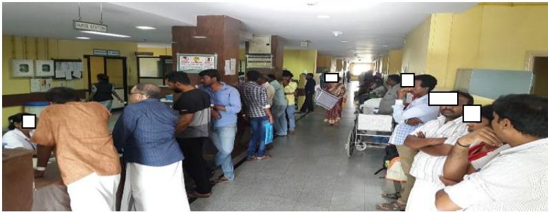
Fig No. 5. Challenging patient populations.