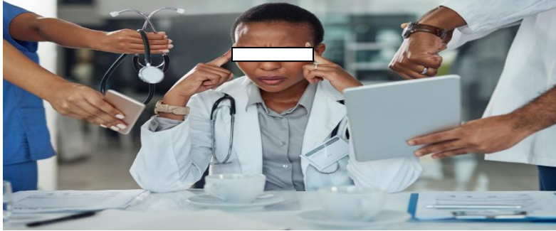
Fig No.4. Interpersonal factors such as stress.