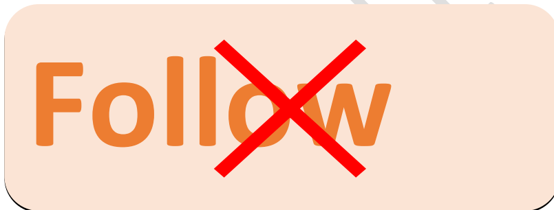
Fig No.6. Lack of follow-up.