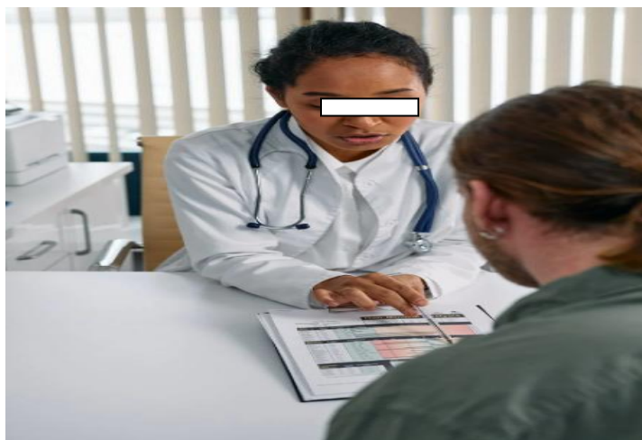
Fig.No.7. In-depth Patient Interview and Counselling.