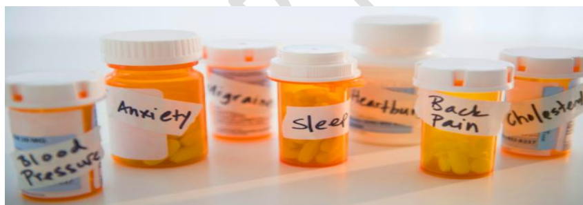
Fig No.3. Polypharmacy.