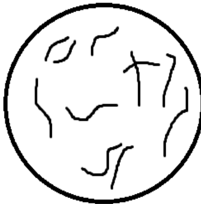
FIGURE 1: MYCOBACTERIUM TUBERCULOSIS

Latent tuberculosis infection (LTBI) and active tuberculosis disease are the two types of tuberculosis. LTBI refers to someone who has an M. tuberculosis infection in which the germs are still alive but not generating active TB disease. People who have LTBI have no symptoms and are not contagious. Those with the LTBI, on the other hand, can acquire active TB disease if they are not treated properly. Active tuberculosis disease (also known as active TB) occurs when the TB bacteria multiply and the immune system of the individual is impaired, resulting in infection. Depending on the individual, active tuberculosis disease might occur soon after infection or take a long time to develop. Excessive coughing, chest pain, weight loss, fever, and exhaustion are all signs of active tuberculosis. People with active tuberculosis are contagious because they can spread the bacterium to others. [1]