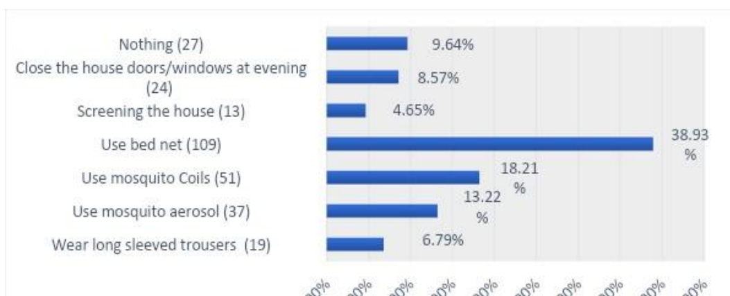
Figure 2 : Bar diagram showing the distribution of practice of respondents on personal protective measures about CKG

Table 4 showed the awareness status of the respondents about the preventive measures, management, and complication of chikungunya. Regarding the personal protective measures, 70 (25%) were aware to keep drain free from blockage, 58 (20.27%) changed water in plant container and 50 (17.86%) covered tightly all water containers, 43 (15.36%) and 13 (4.64 %) placed all the garbage into closed bin and removed unused container, respectively. Only 19 (6.79%) informed DCC to take preventive measures. Regarding awareness about existing preventive measures of the Govt., about half 140 (50%) of the respondents were aware about govt fogging system, destroying the bush 67 (23.93%), improving water drainage system 53(18.93%). The remaining 20 (7.15%) had others and no ideas about existing govt. preventive measures. To manage CKG,189 (67.5%) had opinion to take paracetamol, 33(11.79%) were aware to take bed rest, 28 (10%) took other measures ,17 (6.07%) did not aware to take any specific management and remaining 13 (4.65%) did not know about the CKG management system. Regarding the complication of CKG, about 110 (39.29%) respondents had awareness about the arthritis, 66 (23.57) % and 10 (3.57%) about joint stiffness and skin pigmentations respectively but 79 (28.22%) did not aware about complication of CKG.