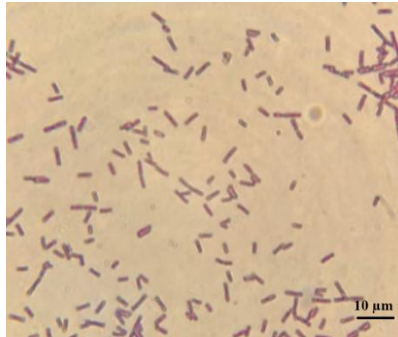
Fig 1. Gram Bacillus CgM22 staining results with 100x magnification

The results of Bacillus CgM22 staining can be seen in Figure 1.