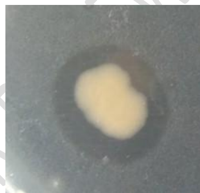
Figure 3. Proteolytic Test Results

amino acids. The clear zone is an indicator that bacterial isolates can utilize casein in the media as a source of nutrition (19).