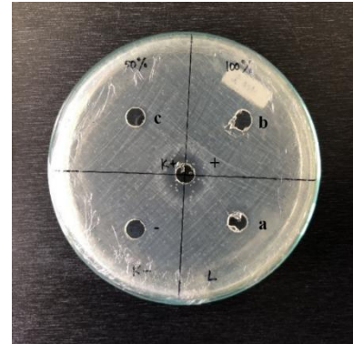
Figure 2. Test Results for Bacillus CgM22 . Inhibitory Zone Description: (a) Culture, (b) 50% supernatant, (c) 100% supernatant, (+) Chloramphenicol 1000ppm,(-) Aquades

and bacterial supernatants 50% and 100%. This test was carried out for 3 days and the results were as shown in Figure 2.