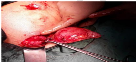
(Figure 2: Mucocoele of the appendix as seen during surgery)