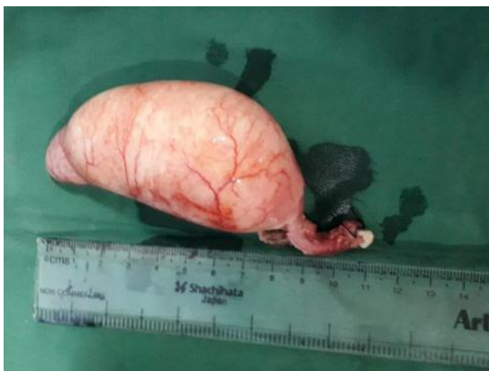
(Figure 3: Mucocoele of the appendix delivered out intact)