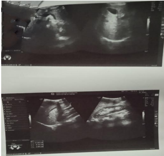
Fig.2 Ultrasound scan of abdomen