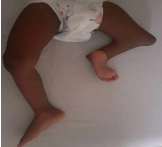
Fig. 3 Showing progression of deformity after 2years