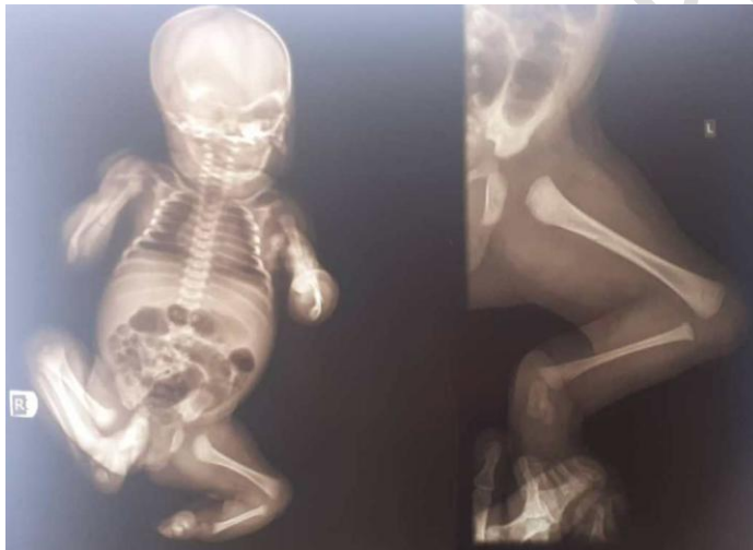
Fig. 2 Babygram showing the deformity on the left

Parents were counseled for reconstructive surgery or ablative surgery depending on their compliance with finance. Two years after the management is for ablative surgery.