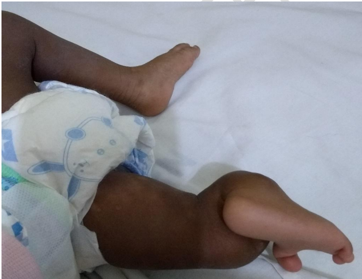
Fig. 1 Gross picture of the deformity

Comment [VS6]: Scientific language recommended