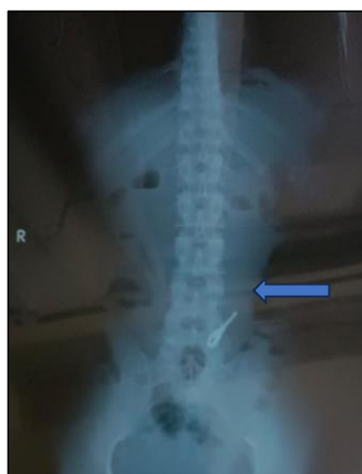
Fig 1: Erect X Ray abdomen showing foreign body in stomach.

Investigations: Radiological investigations were done to confirm the foreign body. Serial radiographs were taken at 6 hours for the first 2 days and 12 hours interval thereafter to confirm its position in the gastro intestinal tract. Gastric outlet obstruction was diagnosed during the attempt of endoscopic retrieval and procedure was abandoned.