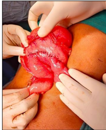
Fig 2 and 3: Image showing retrieved foreign body(key) and gastrojejunostomy post retrieval.