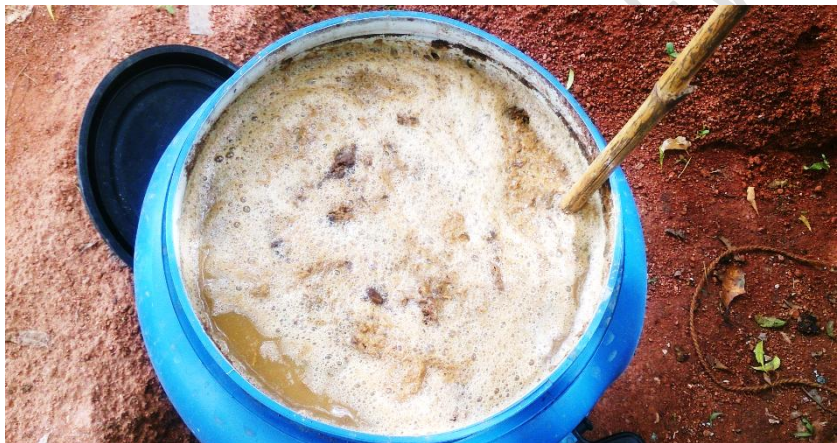
Figure 3. Jeevamrutha