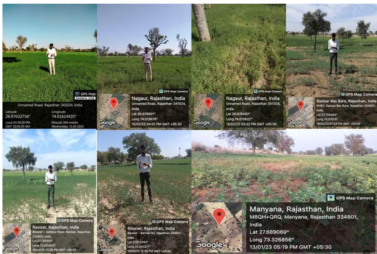
Plate: 1 Survey of wilt disease of fenugreek in major growing districts of Rajasthan