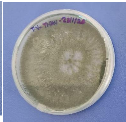
Trichoderma asperellum ECK