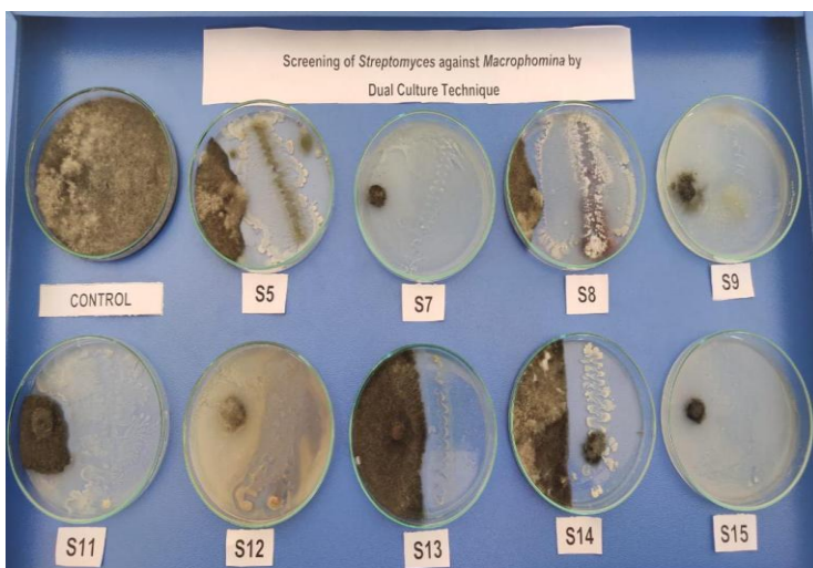
Plate 1. Screening of Streptomyces against Macrophomina by Dual Culture Technique