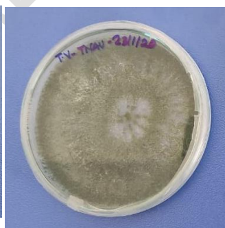
Trichoderma asperellum ECK