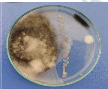
Pseudomonas fluorescens Pf1