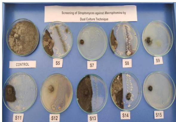
Plate 1. Screening of Streptomyces against Macrophomina by Dual Culture Technique