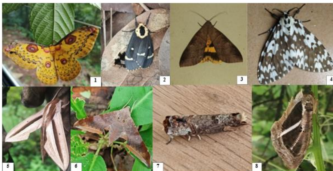
Plate 1: Some common moths in study areas, 1) Loepa ktinka 2) Lymantria semicincta 3) Thyas coronata 4) Lymantria marginata 5) Theretra silhetensis 6) Ambulyx moorei 7) Phalera grotei 8) Eudocima materna

Other researchers also been studied on moth's diversity and reported their diversity on different parts of the country. In 2018, Jena et al. reported 30 different species of moths from Gupteswar proposed reserve forest of Eastern Ghats, Koraput, Odisha, India. In 2022 Sanath et al. reported 31 moth species of 12 different families from Barsuan Range, Bonai Forest Division, Odisha, India. In 2019, Singh et al. reported 486 species of moths from different districts of Punjab. Alex et al. also reported moths of 503 different species from Kavvai river basin of Kerala. In 2021 Pawar et al. reported 45 moth species from Panvel, Navi Mumbai, Maharashtra, India. In 2021, Singh et al. reported 17 moth species from Lalwan Community Reserve of Punjab.