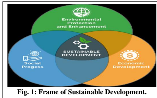
Fig. 1: Frame of Sustainable Development.

The Domains of Environment and Development works as a cause and consequence of each other. The Healthy, Protective and Eco-Friendly Environment supports for the Growth and Development of People and Nation at all levels. On the other side, need based Development by balancing the Resources both Natural and Mobilized will support Environment with minimum impact by taking matching protective and secured measurers.