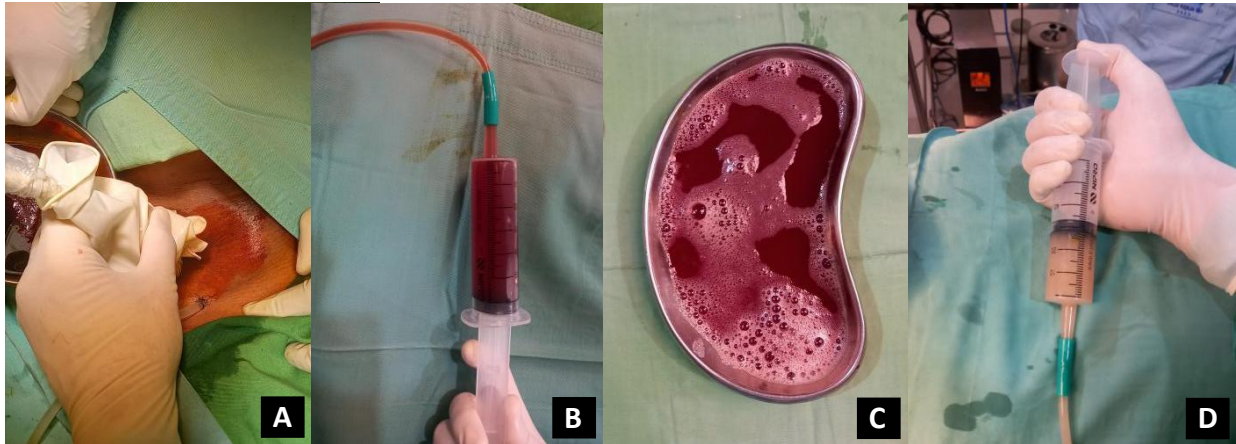
Fig. 3. Intraoperative : drainage tube insertion with US guiding (A), 720 cc liquid drained out from lymphangioma (B and C), 360 cc ethanol solution injection for ablation (D)

After the ethanol ablation procedure, the patient received oral painkiller ketorolac 30 mg / 8 hours. The patient was recovered well for a day in treatment ward. After the patient in good condition, the patient was outward and advised to control the oncology surgery polyclinic for evaluation.