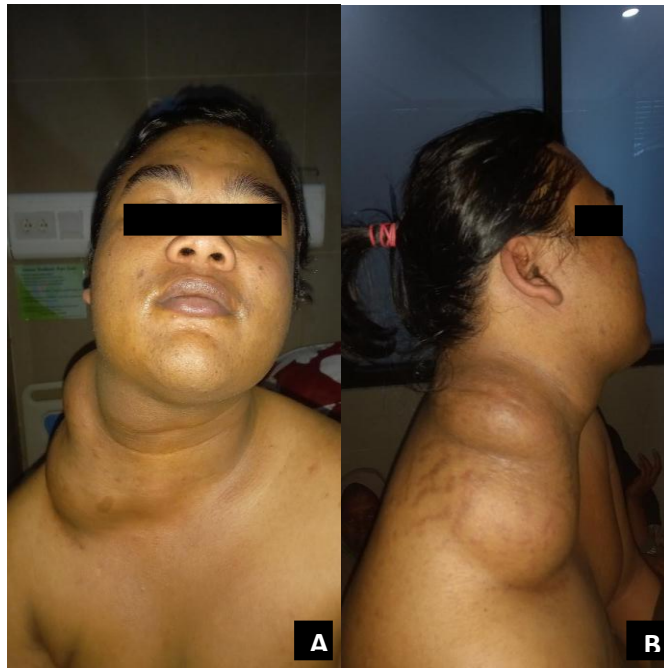
Fig. 1. Preoperative clinical picture (A and B)

The patient has a history of core biopsy and anatomical pathological examination with the results of lymphangioma was carried out in July 2023. The MRI in July 2023 showed a solid mass with cystic areas in the right colli region which extends to the right submandibular region, right supraclavicular, right thoracic inlet, attached to the right carotid artery, m. right sternocleidomastoid, and urgent trachea to the left suggests lymphangioma. The size of the mass was 20 x 15 x 10 cm appearances were consistent with a lymphangioma.