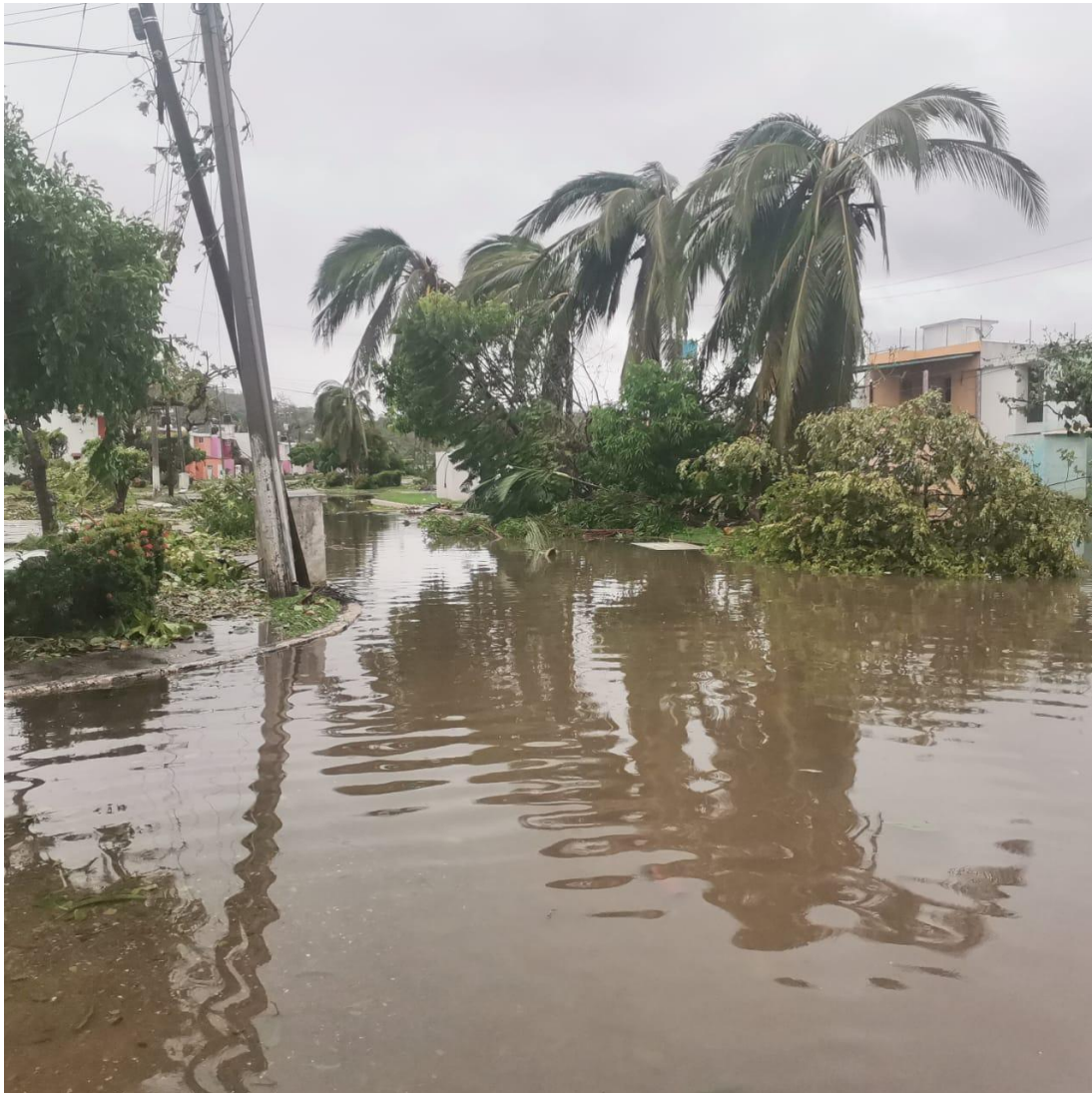
Fig. 3. Garbage, flooding, and tree damage in a residential complex in Acapulco

areas and hotels in the port of Acapulco. The striking devastation in the coastal area illustrates the ferocity of Hurricane Otis and its harmful consequences on various aspects of the environment.