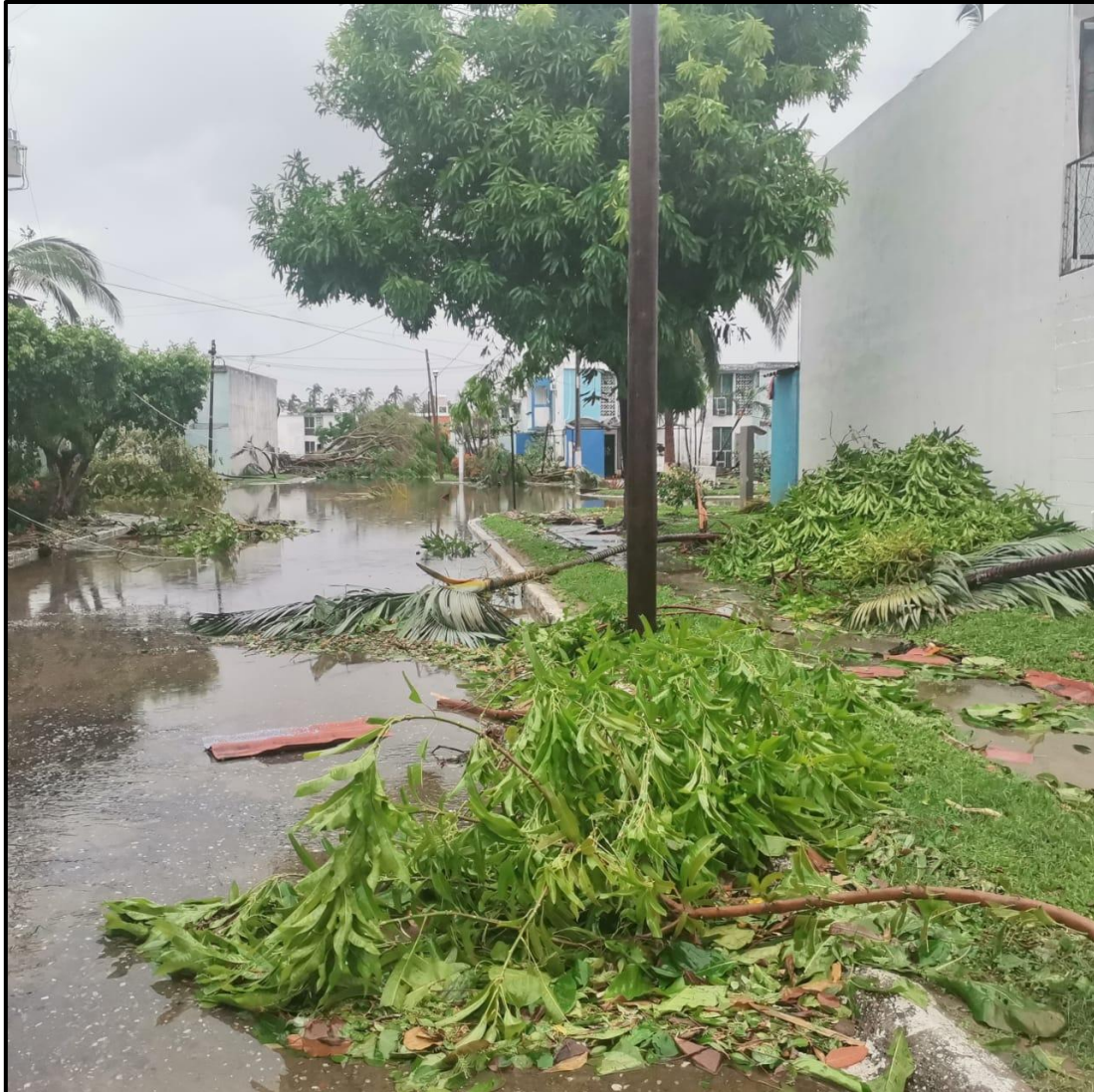
Fig. 2. Effects of Hurricane Otis on a subdivision in Acapulco, Guerrero