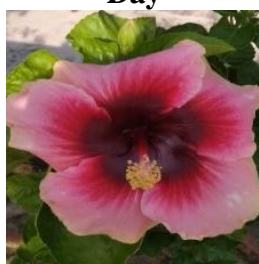
Pod parent - Valentine's Day

During the winter in 2021, the designated female parent was identified one day before pollination. While the flower was at the full balloon stage, the petals and pollen were removed to expose the stigma and this was covered with a piece of packet to avoid pollen contamination. The detailed methodology described by Chakraborty et al.[5,6] and Swamy et al.[7] has been followed.