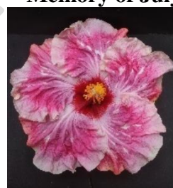
Pollen parent – Moorea Memory of July