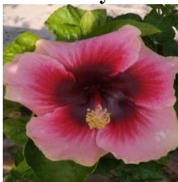
Pod parent - Valentine's Day

During the winter in 2021, the designated female parent was identified one day before pollination. While the flower was at the full balloon stage, the petals and pollen were removed to expose the stigma and this was covered with a piece of packet to avoid pollen contamination. The detailed methodology described by Chakraborty et al.[5,6] and Swamy et al.[7] has been followed.