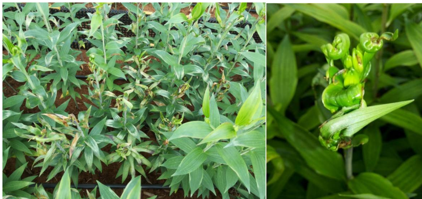
Plate. 1: Severely affected symptom of Upper leaf necrosis in Oriental lily variety 'Paradero'