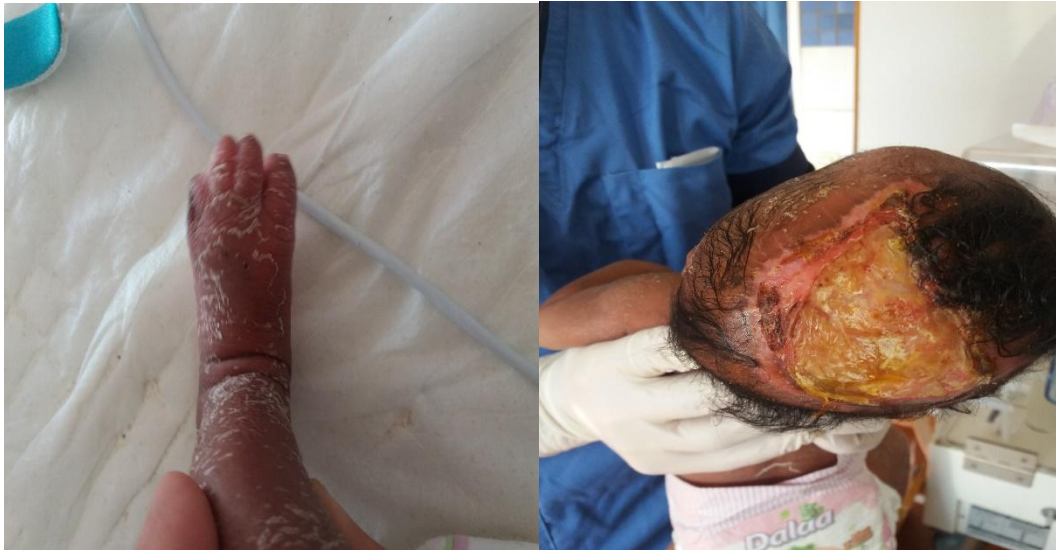
Fig 1a, 1b. Morphology showing Adams-Oliver Syndrome (OSA)