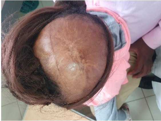
Figure3: Evolution after treatment