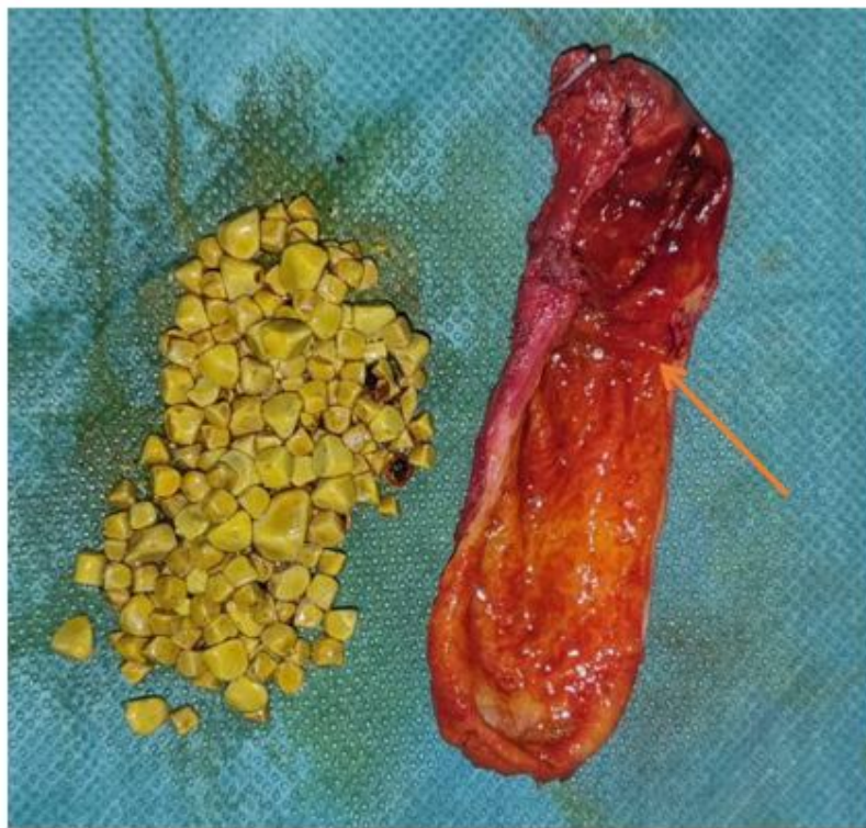
Figure 3 : Specimen of the gallbladder showing the transverse septum

The post-operative follow-up was normal, and the patient was discharged on D-1 post-op.