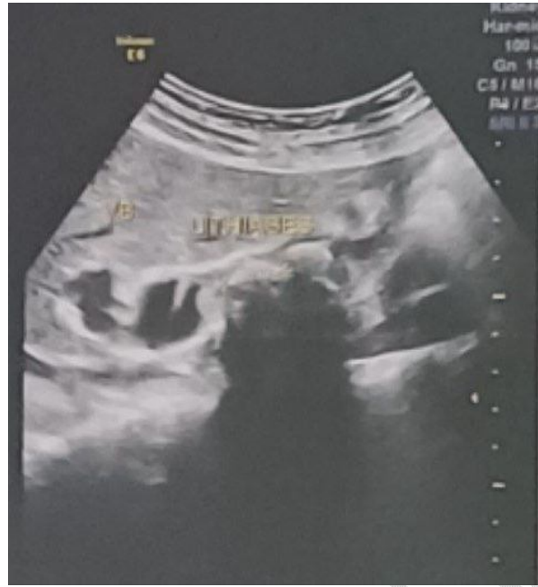
Figure 1 : An ultrasound image of the lithiasis gallbladder