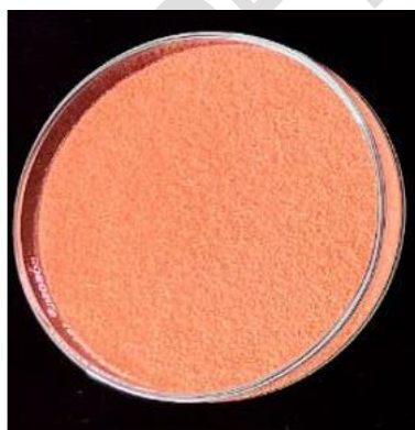
Figure 2. Sensory quality of Coconut Inflorescence Powder