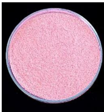
Plate 1. Colour enhancement of Coconut inflorescence powder

Control v/s CIP prepared by boiling in water (95-100°C) for 30 minutes and drying in cabinet dryer at 60°C (C2D1)