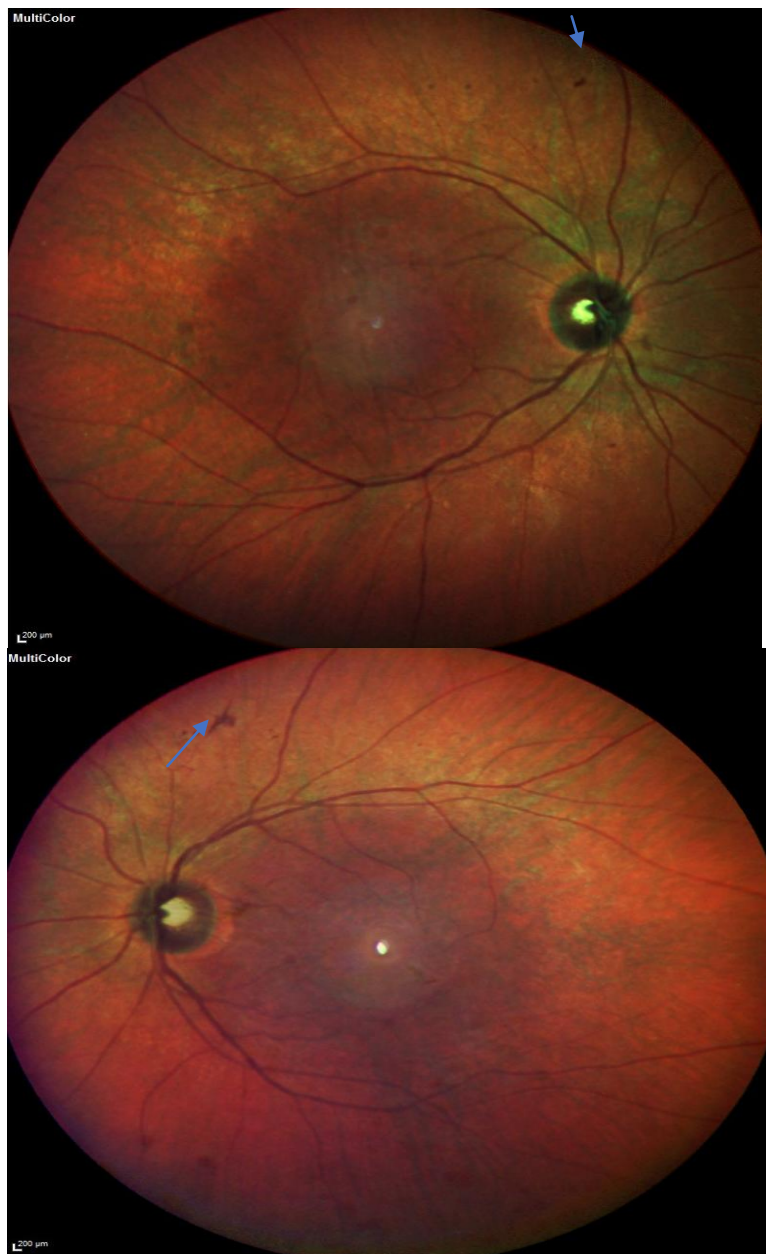
Figure 1 : Color fundus photographs of right then left eyes showing slight hyperpigmentation in a bony spicule pattern in the mid-peripheral retina