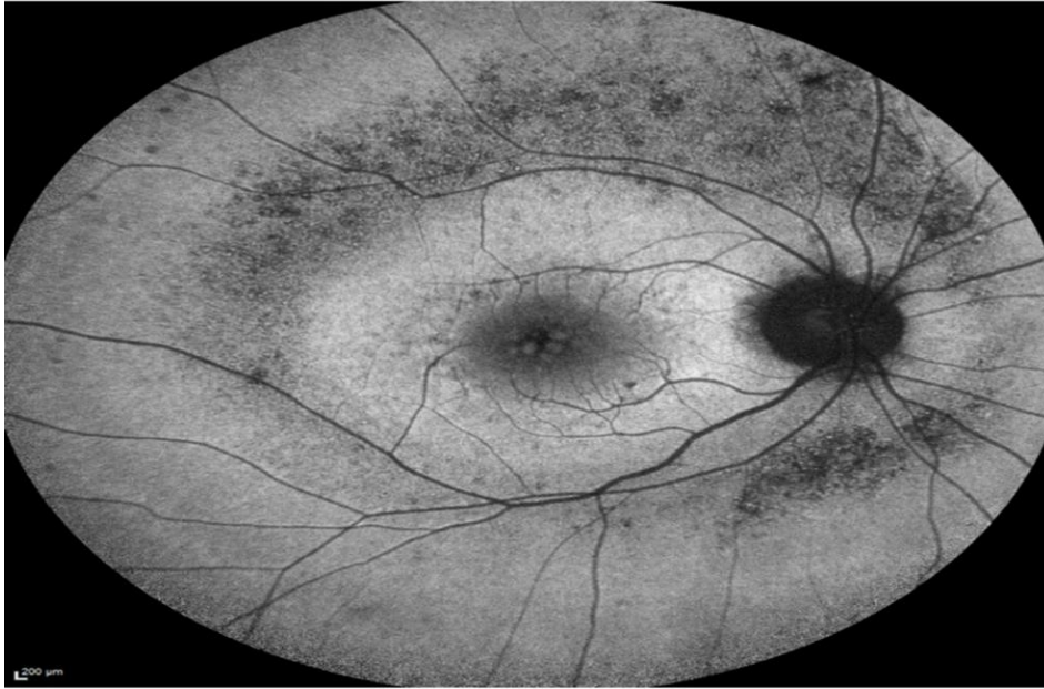
Figure 2 : Fundus autofluorescence (FAF) imaging showing patches of hypofluorescence, initially localized in the periphery, contrasting with a hyperfluorescent ring in the macular region