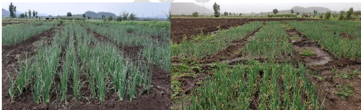
Fig.2. Field performance of onion

Growth parameters (Number of leaves per plant, days to maturity and fresh biomass yield (g/plant), yield and yield components (Bulb diameter (cm), Dry biomass yield (g/plant), marketable bulb yield (t/ha) and unmarketable bulb yield (t/ha)) (See fig 2) of onions was collected from the eight central double rows (out of ten rows). Ten pre-tagged plants were randomly selected in each plot.