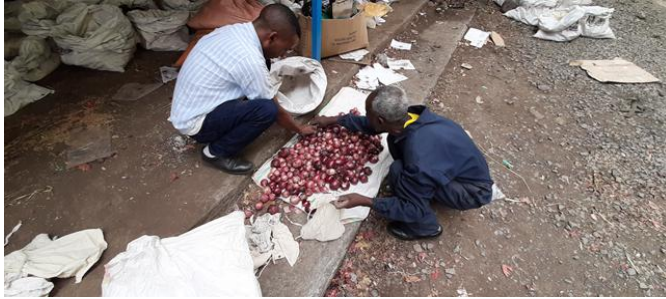
Fig 1: Differentiating marketable and unmarketable bulb yield of onion

Increasing the rate of nitrogen application significantly increased the production of marketable bulb yield across the decreasing rate of the intra-row spacing. The combined application of 69 Kg N/ha with 5 cm of intra-row spacing produced 40.01 t/ha of marketable bulb yield and the lowest marketable bulb yield (15.03 t/ha) was obtained from treatments treated with nil Kg N/ha and wider intra-row spacing of 15 cm (Fig. 3). The observed increase in marketable bulb yield with closer spacing and higher nitrogen rates can be attributed to the greater number of bulbs with marketable size per unit area. Additionally, the higher nitrogen rates facilitated the uptake of readily available nutrients, enhancing growth and ultimately leading to improved assimilate partitioning to the storage organ, the bulb [16]. The present study aligns with the results reported by [16], who observed that the combination of higher nitrogen rates and narrower intra-row spacing (123 Kg N/ha and 6 cm) resulted in a higher marketable bulb yield.