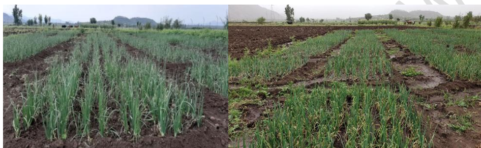
Figure 2 Fig : Field performance of onion

experimental plots when they reached a height of 12-15 cm or at the 3-4 true leaf stage, carefully uprooted from the nursery bed. Only healthy, vigorous, and uniform seedlings were transplanted, and any gaps were filled within a week after transplanting. All plots received a uniform application of Triple superphosphate (46% P_2O_5 ) at a rate of 92 kg P_2O_5 as a source of phosphorus. Additionally, half rates of urea (46% N) were applied during transplanting, while the remaining half rates of urea (46% N) were applied after 30 days of transplanting. Soil moisture was maintained at field capacity during planting, and furrow irrigation was used for water application in each plot. A four-day irrigation interval was upheld for the first four weeks, after which it was extended to five to seven-day intervals until 15 days before harvest, at which point irrigation was completely stopped (EARO, 2004).