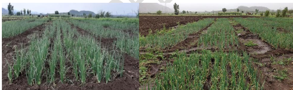
Fig.2. Field performance of onion

Growth parameters (Number of leaves per plant, days to maturity and fresh biomass yield (g/plant), yield and yield components (Bulb diameter (cm), Dry biomass yield (g/plant), marketable bulb yield (t/ha) and unmarketable bulb yield (t/ha)) (See fig 2) of onions was collected from the eight central double rows (out of ten rows). Ten pre-tagged plants were randomly selected in each plot.