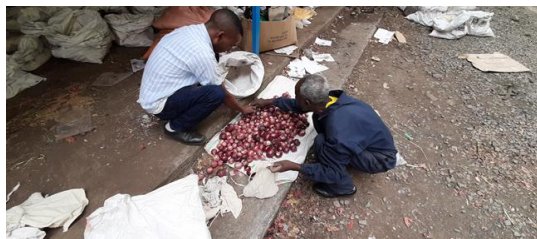
Fig 1: Differentiating marketable and unmarketable bulb yield of onion

(15.03 t/ha) was obtained from treatments treated with nil Kg N/ha and wider intra-row spacing of 15 cm (Fig. 3). The observed increase in marketable bulb yield with closer spacing and higher nitrogen rates can be attributed to the greater number of bulbs with marketable size per unit area. Additionally, the higher nitrogen rates facilitated the uptake of readily available nutrients, enhancing growth and ultimately leading to improved assimilate partitioning to the storage organ, the bulb [16]. The present study aligns with the results reported by [16], who observed that the combination of higher nitrogen rates and narrower intra-row spacing (123 Kg N/ha and 6 cm) resulted in a higher marketable bulb yield.