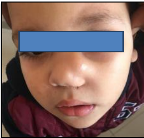
Figure 1: Preoperative image of the 5 year old child.

same as the bone which seems to be attached to. The skin overlying the mass appeared normal, intact, with no inflammatory signs or sensitivity disorders. Nasal examination found a normal overlying pituitary mucosa on a bone swelling hindering the examination of the rest of nasal cavity. There was no further complaint. General physical examination was quite normal.