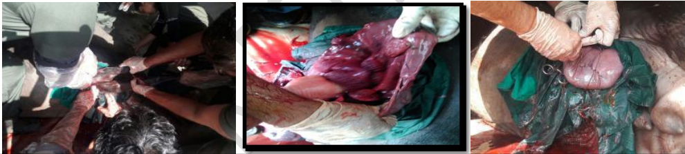
Fig-14: The dead male fetus was extracted, fluids were drained, placenta removed manually and four furea bolus kept inside uterus and uterine incision was closed by cushioning followed by double row of lembert pattern sutures using chronic catgut no.1#0 .