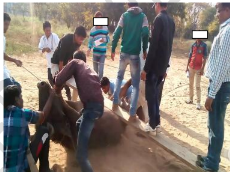
Fig-7: Rotation of animal in clock wise direction