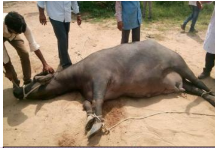
Fig-5: Restraining the buffalo in right lateral recumbency

Comment [S7]: U can delete fig. 4, 5, 8, 11, 13