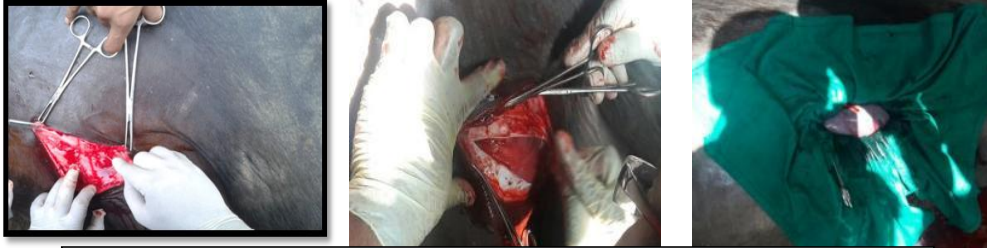
Fig-12: skin, muscle, peritoneum and uterus were opened by incised in longitudinal fashion