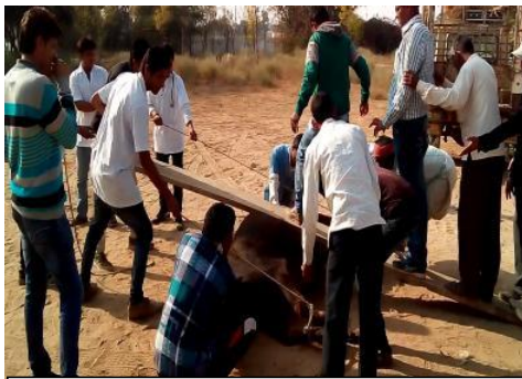
Fig-6: Placing the plank over the abdomen

Comment [S7]: U can delete fig. 4, 5, 8, 11, 13