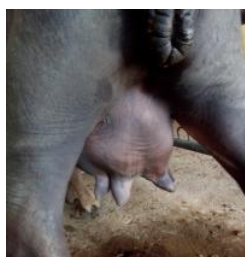
Fig-3: Mammary glands fully engorged with milk

On per-vaginal examination revealed that the uterine fluid discharges was not observed, vagina was relaxed, severe twisted vaginal fold was palpated going toward right lateral side lateral downward and forward, direction of the twist towards the right side and the external os-cervix could not be palpated or unable to palpate the cervix . On per-rectal examination revealed that the broad ligament of left side is stretched (extending) toward the right side (right side broad ligament sinking beneath the uterus), uterine surface was tense with thick walled, fremitus was absent, foetus was not palpated. Further Complete two uterine fold were palpated and the arrangement of broad ligaments with the spiral twist in the uterus just post-caudal to the cervix indicated more than 270 0 right-sided uterine torsion. Based on the history, a clinical sings, per-