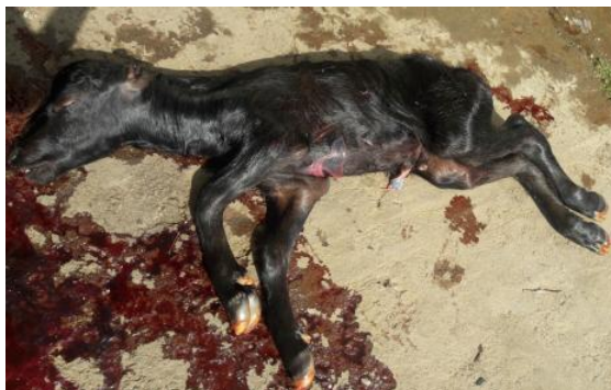
Fig-16: Delivered dead large size male fetus