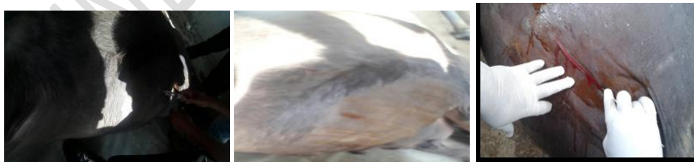
Fig-11: Aseptic precaution with oblique abdominal incision extending from point of stifle towards umbilicus above 5 cm parallel to milk vein on left side

Comment [S8]: Whether the fetus was emphysematous or not. The photo of fetus doesn't reveal it