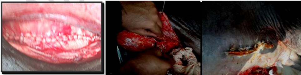
Fig-15: The remaining peritoneum, muscles and sub-cutis layers were closed by continuous lock-stitch pattern sutures using chronic catgut no.2#0; then lastly skin layer was closed by horizontal mattress pattern sutures using cotton thread non absorbable sutures material.