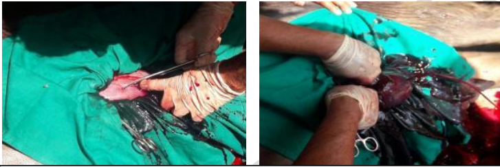
Fig-13: The exteorization of uterus, uterine amniotic cavity and its wall was incised in longitudinal fashion at greater curvature avoiding cotyledons