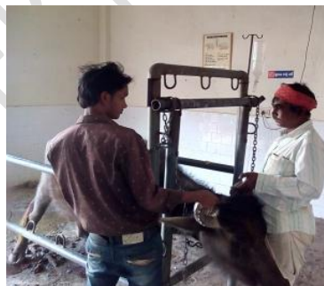
Fig 8: Buffalo pre-medicated treatment