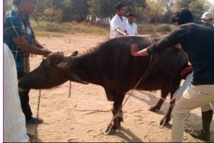
Fig-4: Restraining the buffalo by holding fore limbs and hind limbs of buffalo