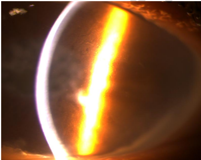
figure1: slit lamp image showing an inflammatory tyndall in the anterior chamber

y complications and avoid affecting the prognosis of cataract surgery.