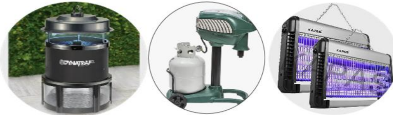
a) Mosquito trap b) Mosquito magnet c) Electric mosquito zipper

These traps mimic numerous mosquito attractants, including body heat and exhaled carbon dioxide. They are powered by electricity, therefore their operation is safe. When a mosquito is drawn to an impeller fan, it attaches to the sticky surface of the trap and is shocked (Sumithra et al., 2014).