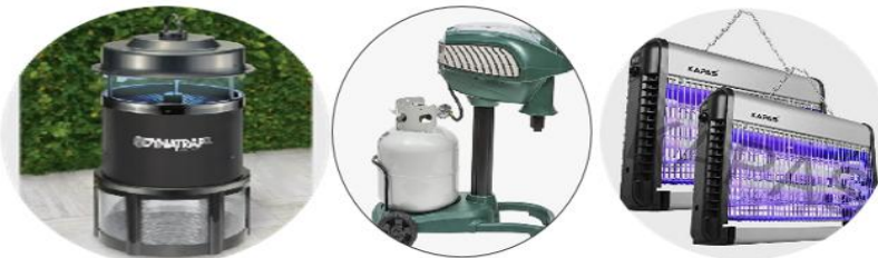
a) Mosquito trap b) Mosquito magnet c) Electric mosquito zipper

These traps mimic numerous mosquito attractants, including body heat and exhaled carbon dioxide. They are powered by electricity, therefore their operation is safe. When a mosquito is drawn to an impeller fan, it attaches to the sticky surface of the trap and is shocked (Sumithra et al., 2014).