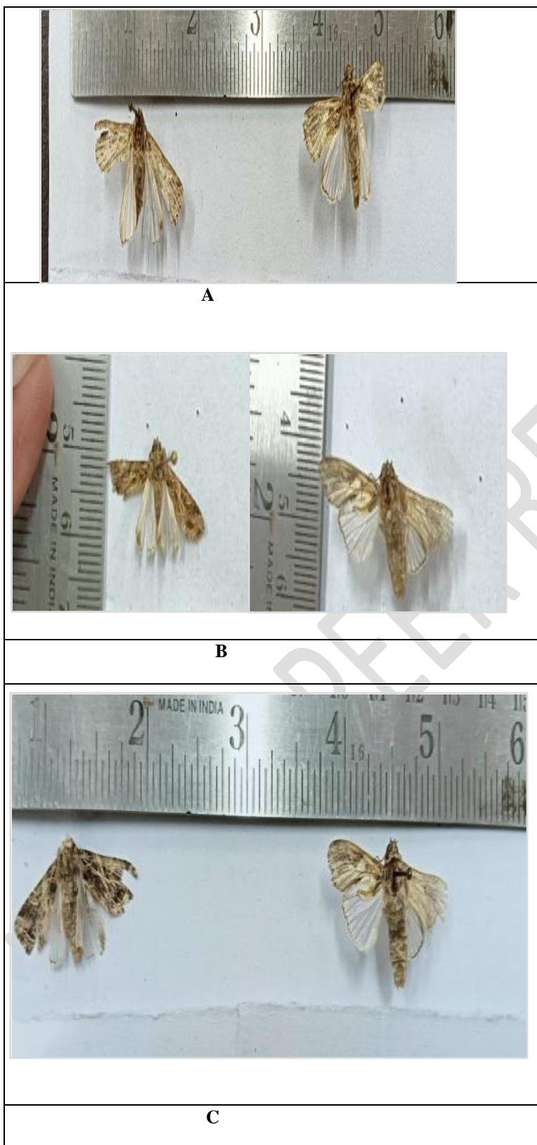
Plate 2: Morphometric study on adult moth of Spodopteralitura . A- Adult moth of tomato. B- Adult moth of maize. C- Adult moth of marigold.