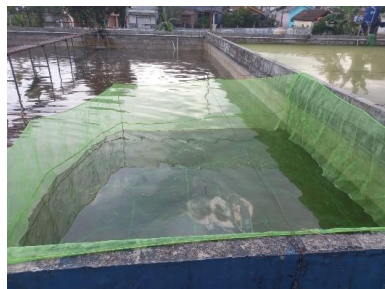
Fig. 2. Fish spawning container