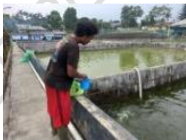
Fig.1. Feeding broodstock process