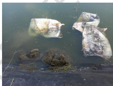
Fig. 3. Pond fertilization process

The nursery pond, measuring 24 m x 20 m x 1 m, is an earthen pond lined with HDPE plastic. Prior to stocking the larvae, preparations are made. This begins with a pond cleaning regimen, followed by pond drying, which serves the dual purpose of eliminating bacteria and pathogens. Next, a meticulous inspection of water channels, leaks, and seepages is conducted, followed by the application of a liming agent at a rate of 50 g/m 2 . After liming, the pond is filled with water. Once filled, organic fertilizer is applied at a rate of 500 g/m 2 (see Figure 3). According to [7], pond drying typically lasts 5-7 days. Surface cracks in the pond soil indicate sufficient aeration, facilitating organic matter decomposition. This drying process effectively expels organisms residing in soil fissures, ensuring pathogen-free conditions. Additionally, it aids in the release of trapped toxic gases from the pond's bottom.