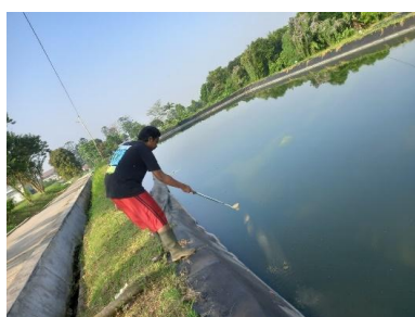
Figure 7. Larvae Feeding process

To provide food in the nursery pond effectively, a technique involves encircling the pond in the direction of the wind while dispersing the feed. This method ensures that the food is evenly distributed throughout the pond and minimizes wastage (Figure 7). Throughout the 24-day maintenance period, each nursery pond consumed an average of 33 kg of fine feed. This amount equated to 20% of the biomass, reflecting the protein requirement of common carp fry, which exceeds 30% [15].