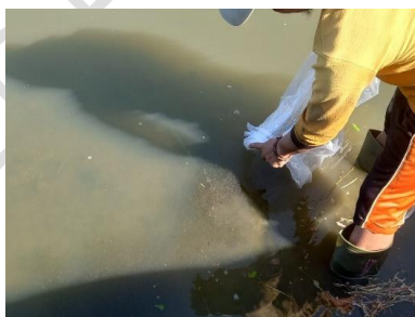
Fig. 6. Larvae distribution

The nursery phase represents the range from spawning through the rearing of larvae to the production of seeds. Nursery I, in particular, extended for a duration of 24 days within ponds Blocks A8, A12, A16, and BM1. Before the larvae were transported to the nursery pond, they were initially counted using a 100 ml measuring cup, after which they were placed in plastic packing bags for transportation. Upon arriving at the nursery pond, the larvae were gently dispersed into the water, as depicted in Figure 6. This process incorporates an acclimatization step to ensure that the larvae can adapt seamlessly to their new environment, reducing stress levels. Each plastic bag accommodated 4 measures, with one measure containing 25,000 carp larvae. In total, 600,000 larvae were distributed across four nursery ponds, namely pond blocks A8, A12, A16, and BM1, at a stocking density of 300 fish/m 2 .