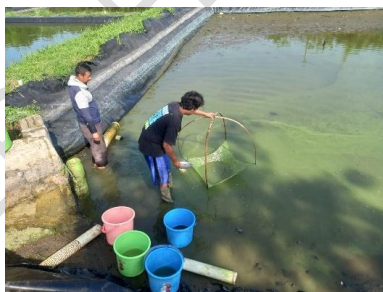
Fig. 10. Fryharvesting process

The process of harvesting is initiated after the 24-day maintenance period. It involves closing the inlet channel and draining the pond through the outlet pipe, with hapa used to prevent fry from escaping (Figure 10). Pond drainage is conducted in the morning to ensure that harvesting is performed without undue stress on the fry. Once the water has receded, larvae are collected within the pond using a waring tool, and subsequently, a fine aluminum blade is employed to remove them. The collected fry are then placed in a bucket filled with water before being stored in a suitable container. The sheltered fry undergo a sorting process to ensure uniformity in size among the fish.