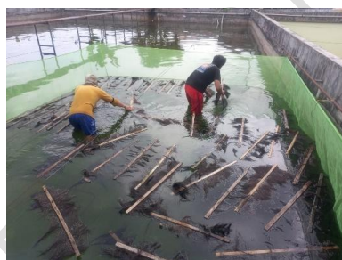
Fig. 4. Kakaban arrangement for spawning

Carp have an oviparous reproductive system, which means that they reproduce sexually, with the release of male and female egg cells, spermatozoa outside the body, and fertilization outside the body. Common carp can spawn naturally through external fertilization. The fertilized eggs will attach themselves to the aquatic substrate or aquatic plants in the water. Common carp hatchery is carried out organically, semi-artificially, or entirely artificially in culture operations using spawning promoting hormones. Natural spawning occurs when mature male and female fish are paired in spawning tanks with a male to female ratio of 2:1 to 3:1.