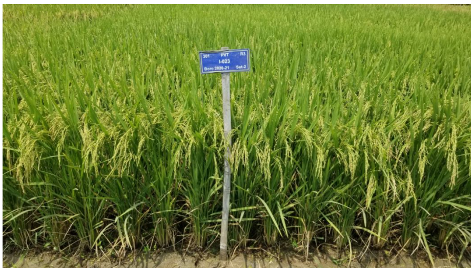
Figure 1: Pictorial view of IR99285-1-1-1-P2 (BRRI dhan102) in the field condition