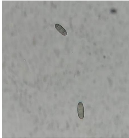
Plate 1: Growth of Bipolaris oryzae in petri-plate and its spores