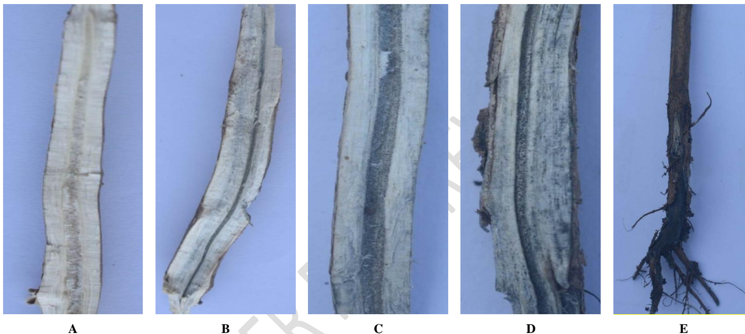
Figure 1: Depiction of Root and stem severity index of charcoal rot