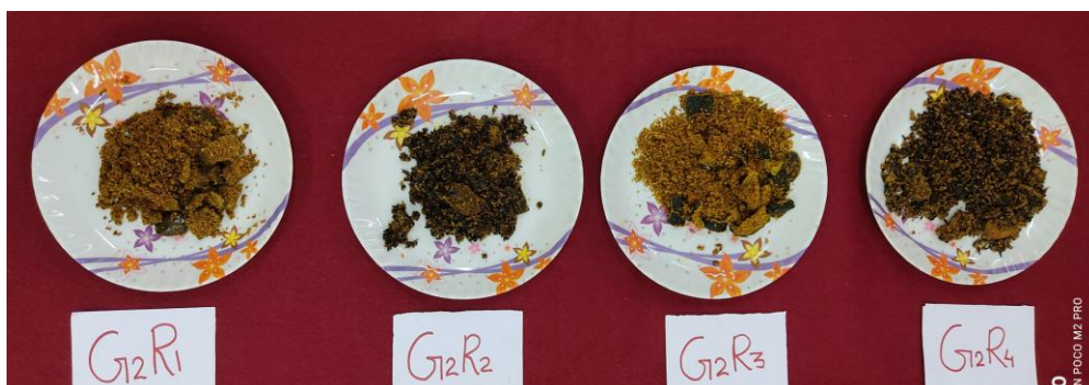
Fig. – 2. Mango pickle of genotype-2 (Shravnya) and recipe-I, II, III and IV after 150 days of storage