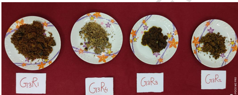
Fig. – 3. Mango pickle of genotype-3 (Telya) and recipe-I, II, III and IV after 150 days of storage