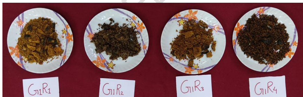
Fig. – 1. Mango pickle of genotype-1 (Galu) and recipe-I, II, III and IV after 150 days of storage