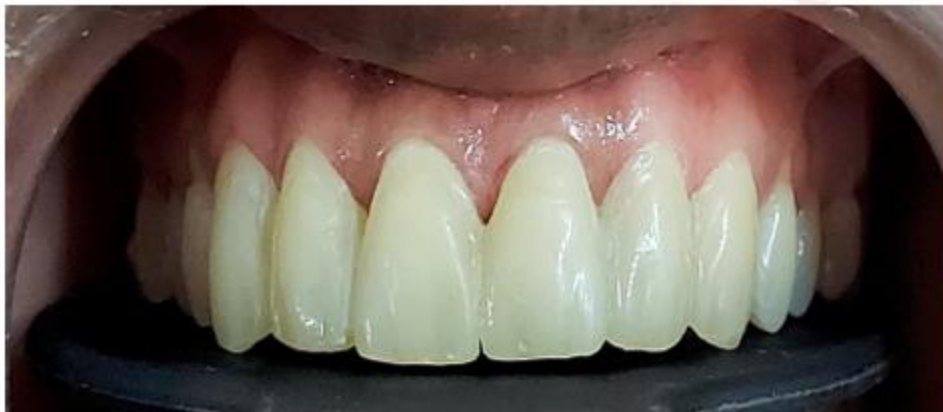
Fig 5- post operative picture after completion of injection moulding.