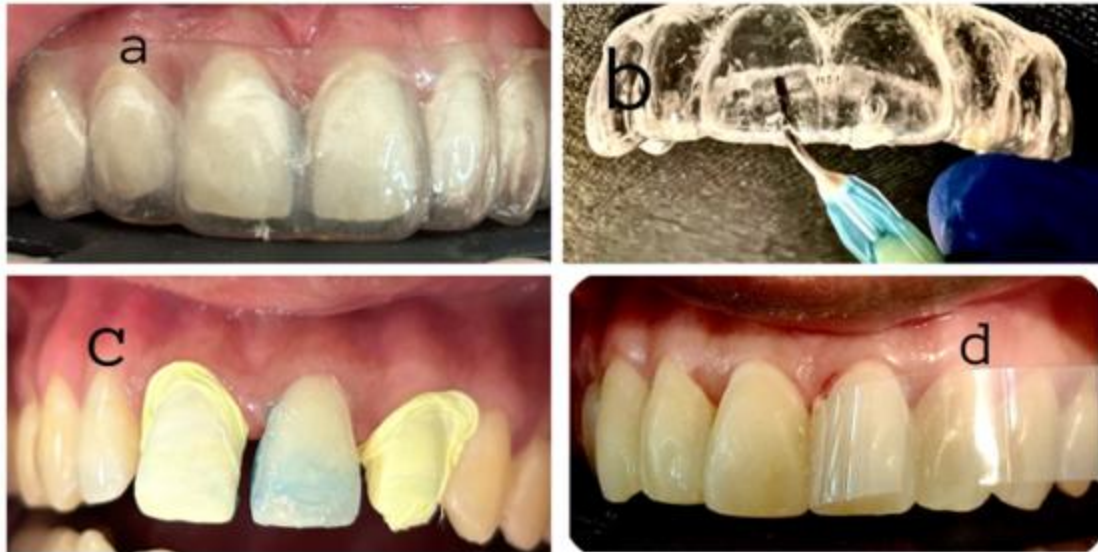
Fig 4- a)Tray fit was checked intraorally, b)Vents made at the incisal edges on the tray, c)Each tooth was prepared separately (isolation of adjacent teeth using Teflon Etching , bonding and injecting the composite), d) Inter proximal space was confirmed using Mylar strip