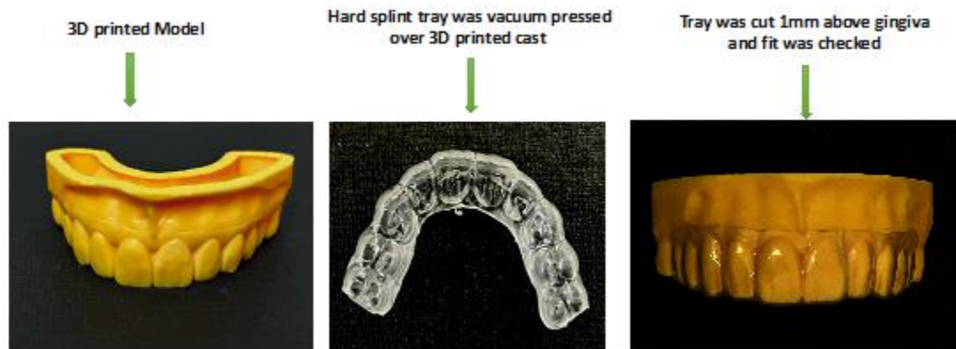
Fig 3- shows 3D printed model, hard splint tray , fit of the tray was check on 3D printed model and cut 1mm above the gingiva.